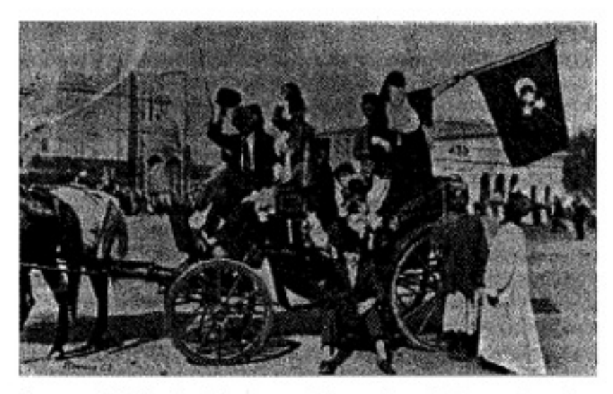
Figure 17. "An Egyptian lady goes out in her carriage with the members of her family the day of the big holiday—8 April—to participate in the manifestations of joy, and her sister has raised the beloved Egyptian flag." Al-Lata'if al-Musauwwara, 5 May 2929, 6.