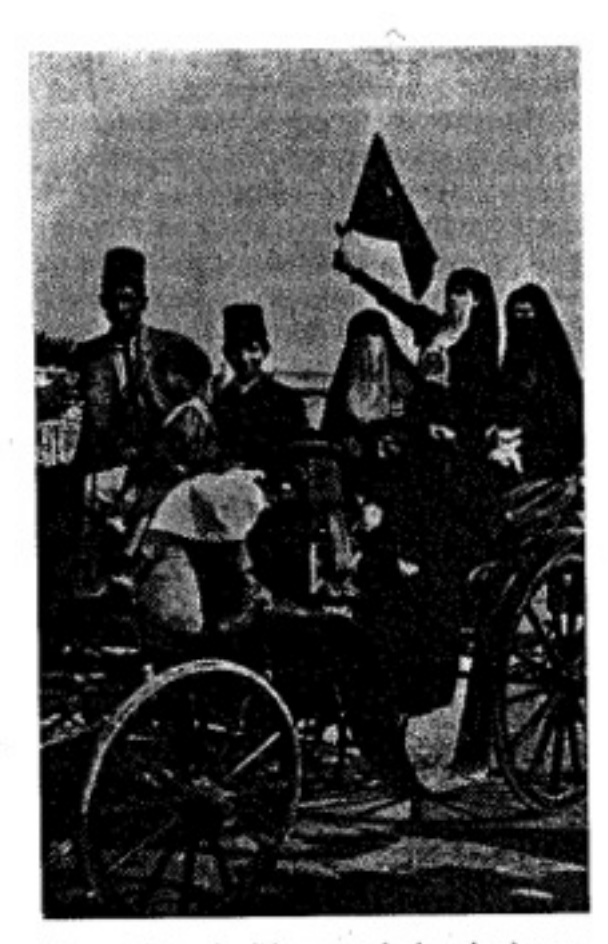
Figure 16. "A splendid scene took place that happy day [8 April 1919]: the undertaking of Egyptian ladies to cheer the people and the nation." Photograph by the Ramses Company, 8 April 1919. Al-Lata'if al-Musawwara, 21 April 1919, 6.

Source: Images from Baron, Beth. Egypt as a Woman: Nationalism, Gender, and Politics. 2007.